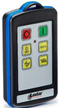
4F Keypad only available